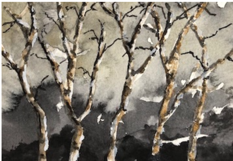
Winter Birch. Mar