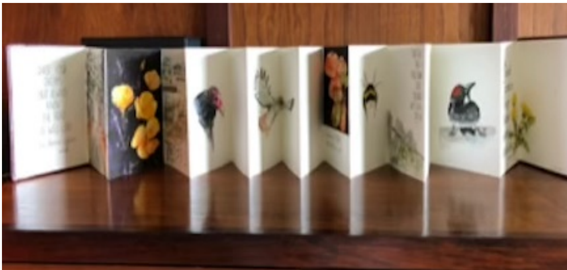
Accordion Diary. Suzette