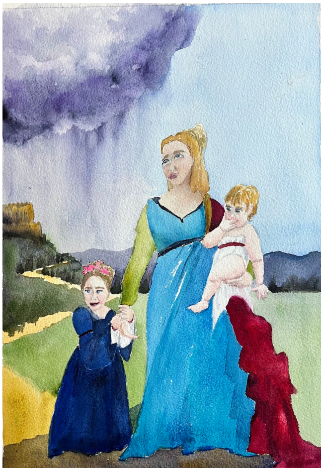
Gathering Storm. KC