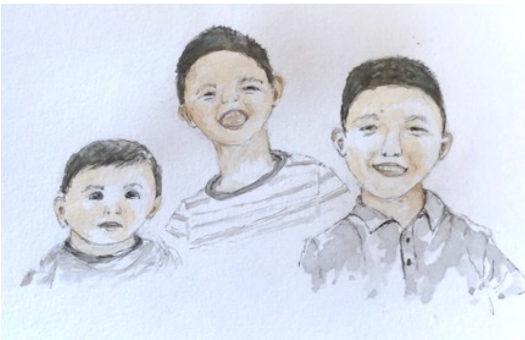
Three Brothers. Mar