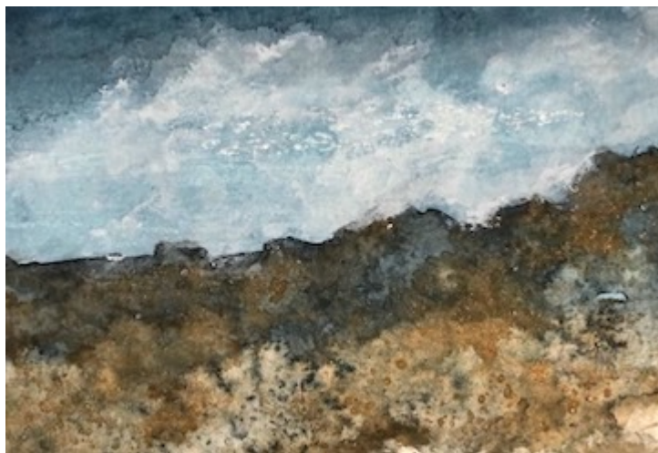
Night Shore. Mar