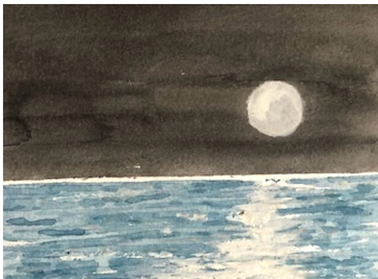
Moon Dance. Mar