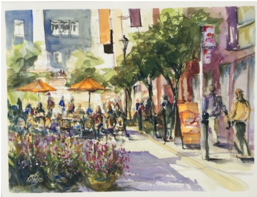
SF Street Café. Mark