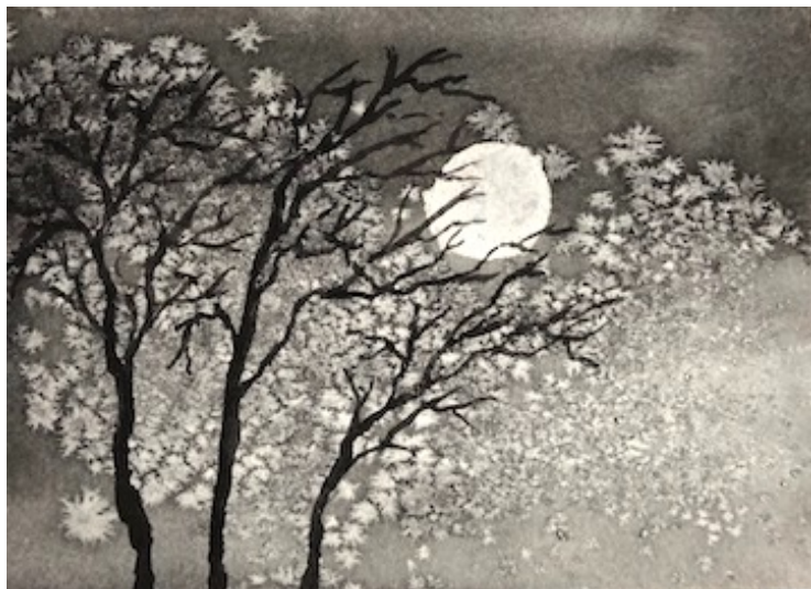
Night Blooms. Mar