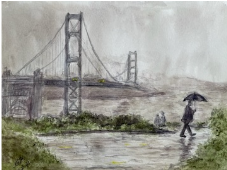
Foggy Day with Pedestrians. Nancy