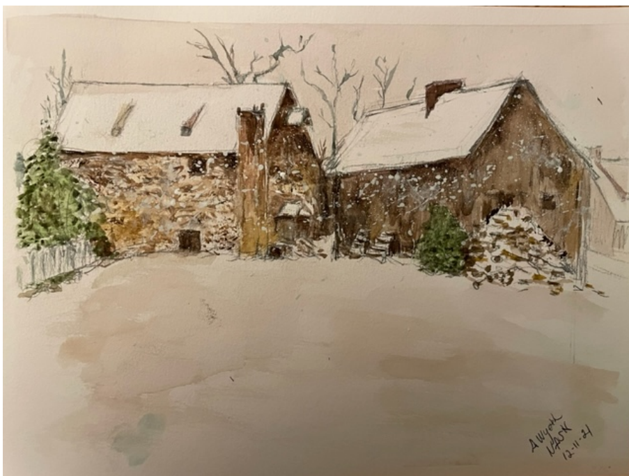
Andrew Wyeth. The Grannary. Nancy