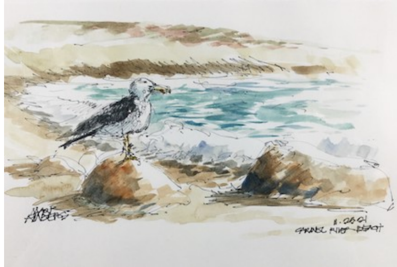
Gull at Carmel River Beach. Mark