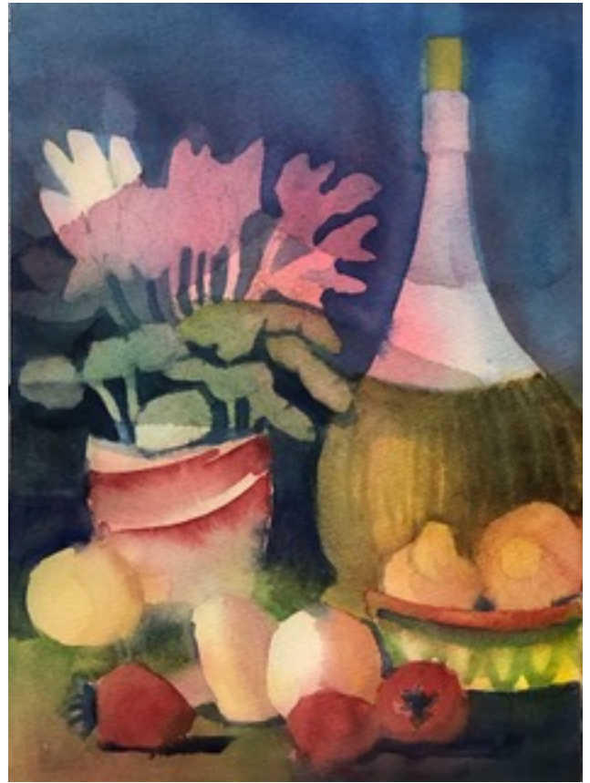
Mushrooms and Strawberries. Rose