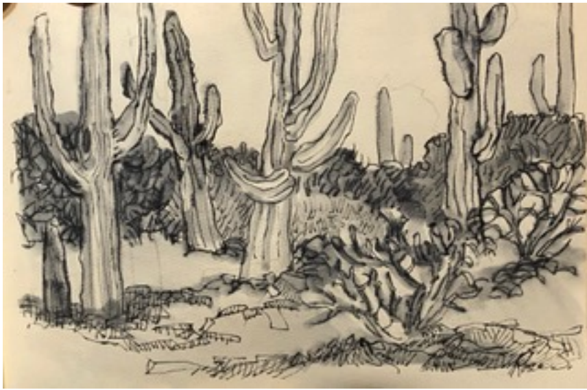
Arizona Landscape Drawing. Rose