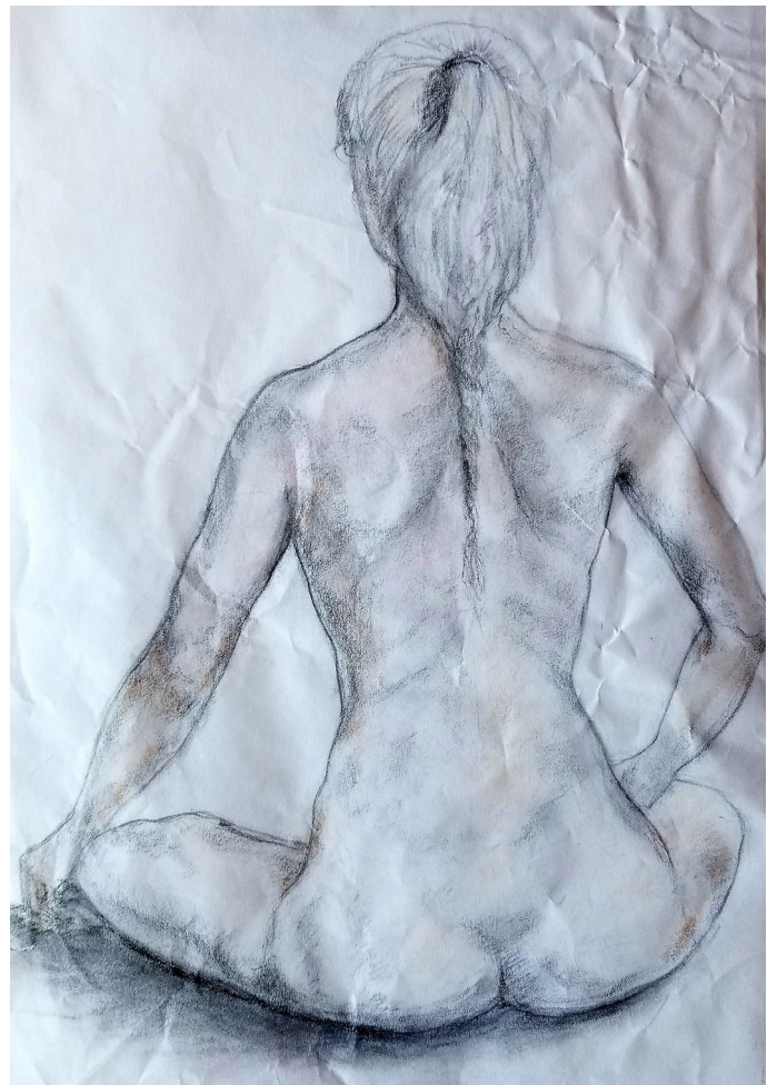
A Past Sketch. Mili