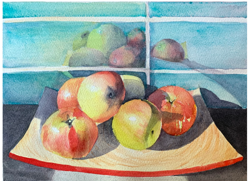
Honey Crisps on Blue Tile. KC