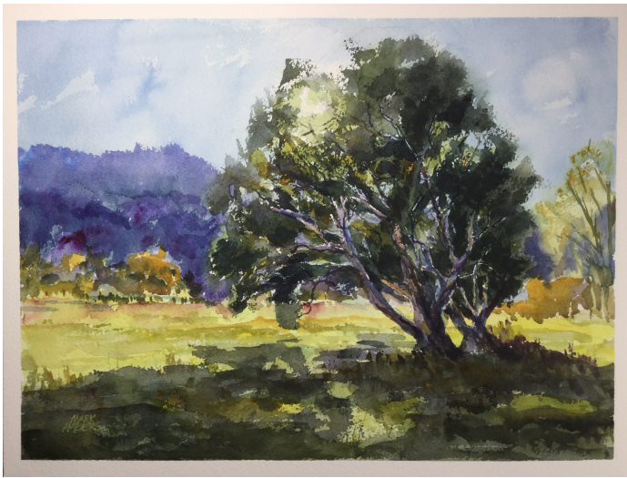
Palo Corona Oak.