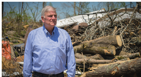
Franklin Graham, President of Samaritan's Purse