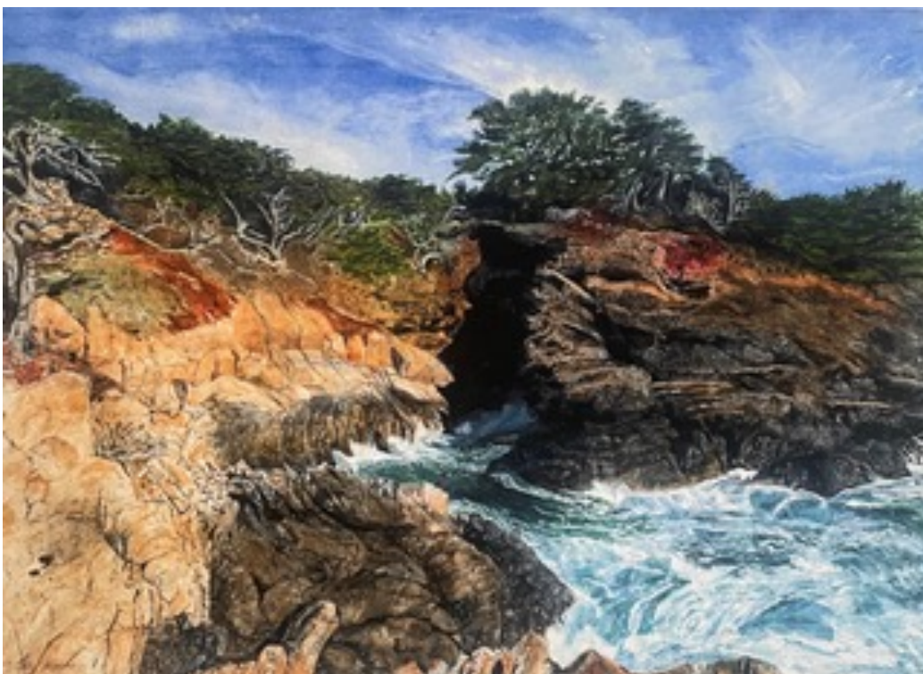
Point Lobos. Tomi