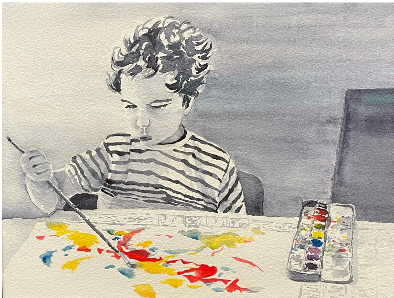
The Painter. KC