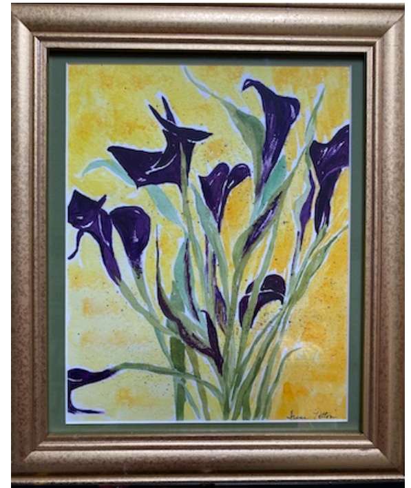
Purple Callas. Irene