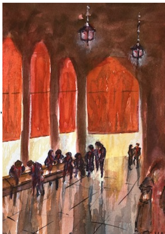
Rialto Fish Market, Venice. Mar