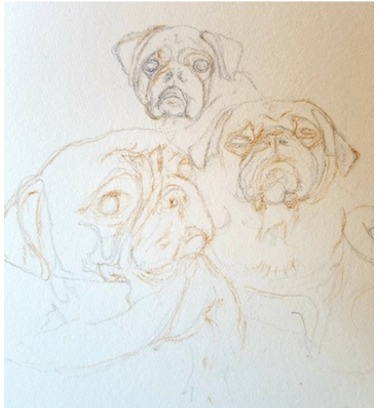
Dog Sketches. Mili