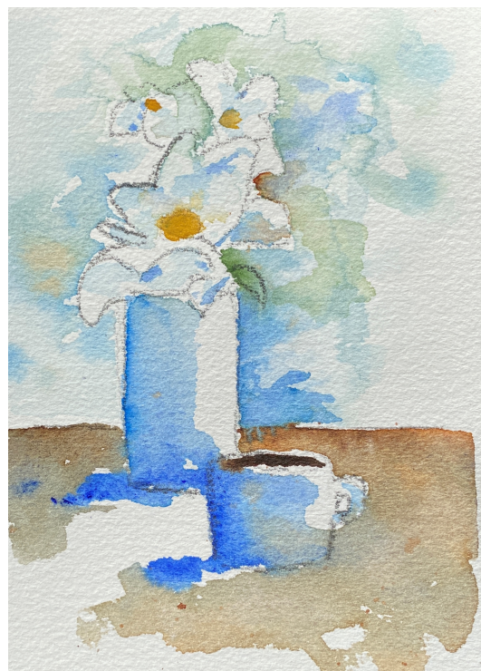
Hard Edge. Lynn