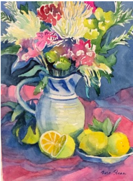
Lemons and Blue Vase. Rose