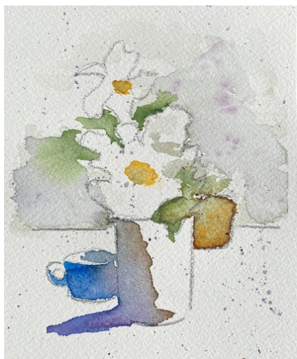
Lost Edge #1. Lynn