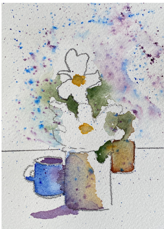
Lost Edge #2. Lynn