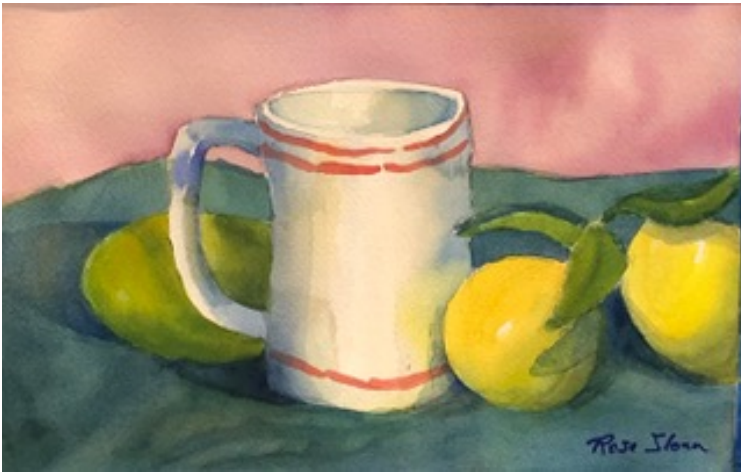
Softening Edges #1. Rose