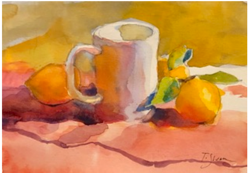
Warm Colors Study. Tim