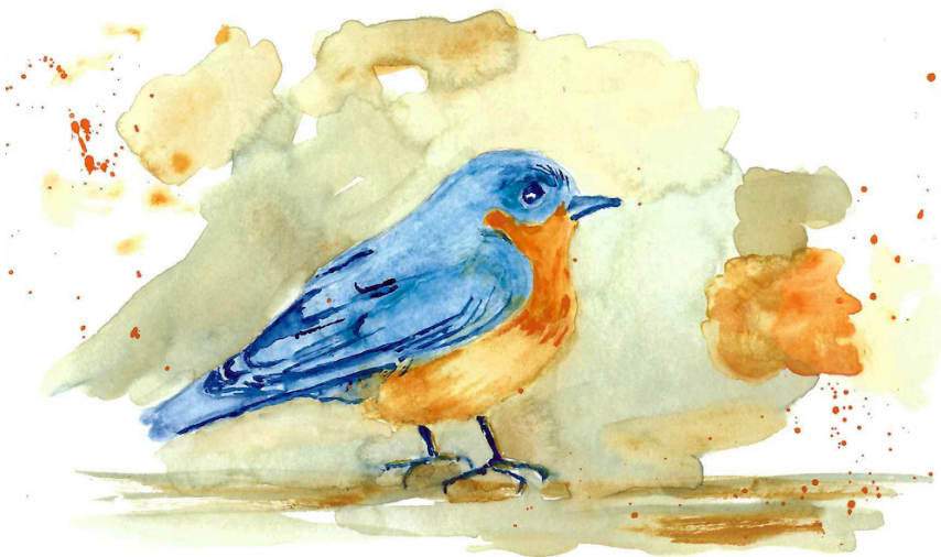
Eastern Blue Bird. Mike