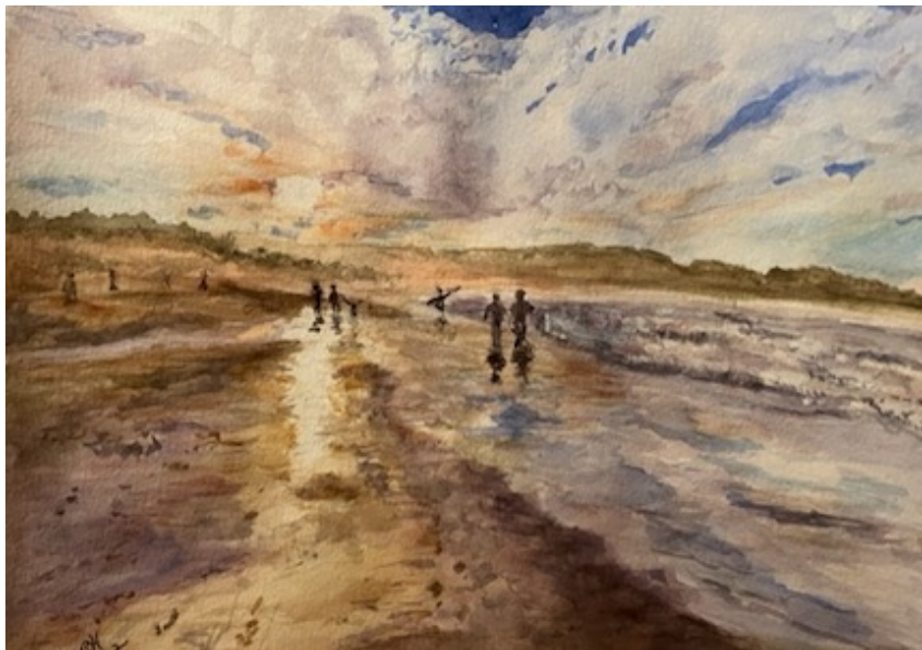
Del Monte Beach Walk. Nancy