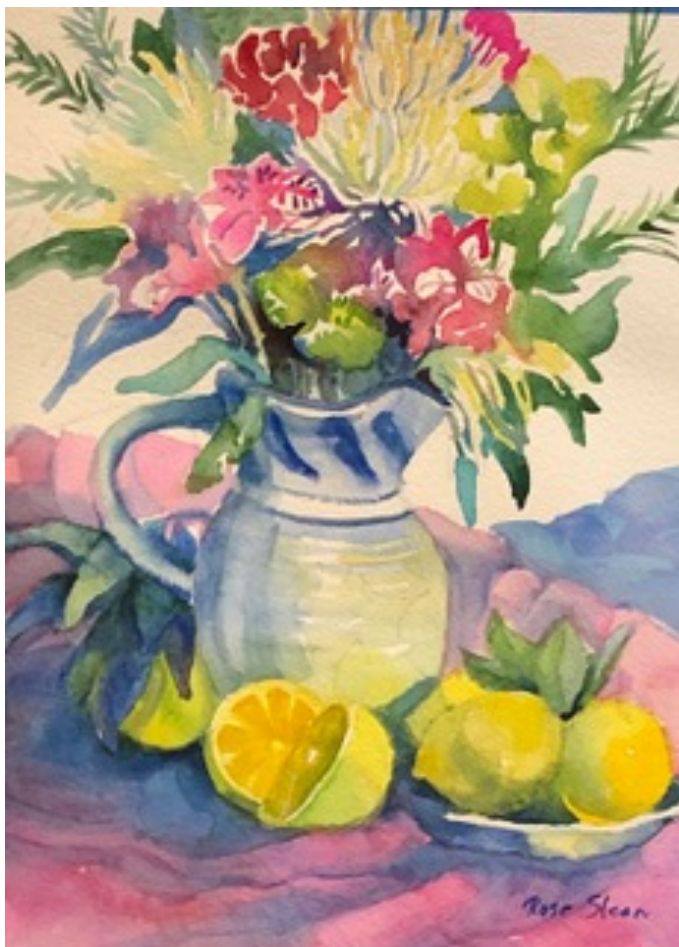
Flowers in Blue Vase. Rose