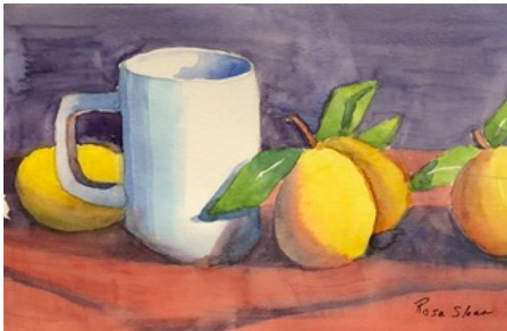
Softening Edges #2. Rose