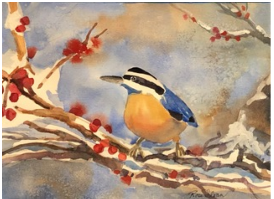
Cold Winter Day. Rose