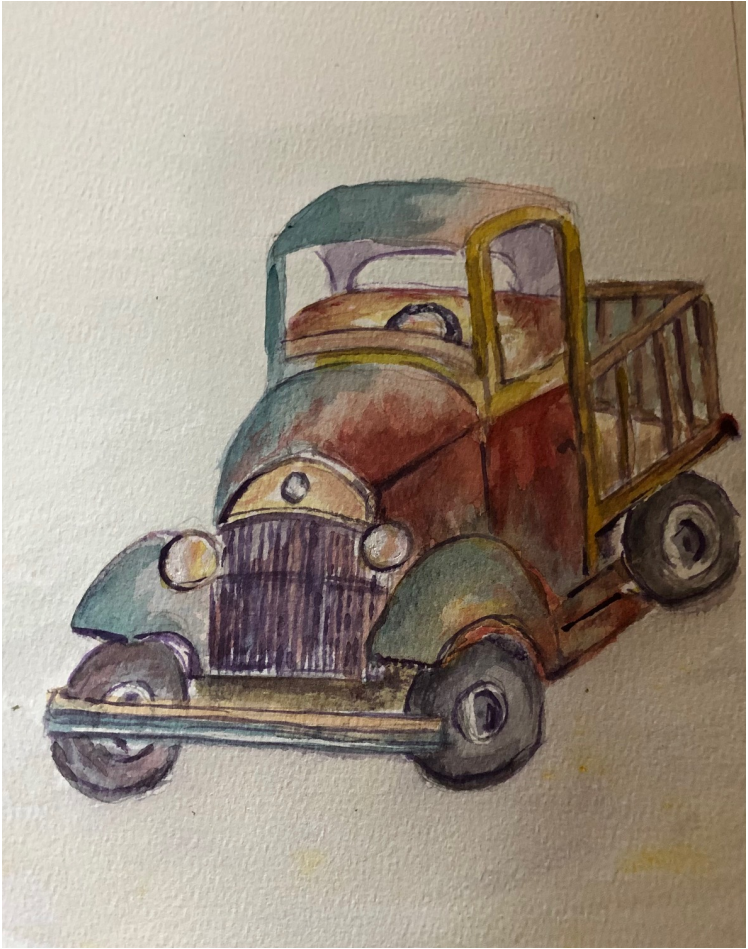
Old Farm Truck. Mar