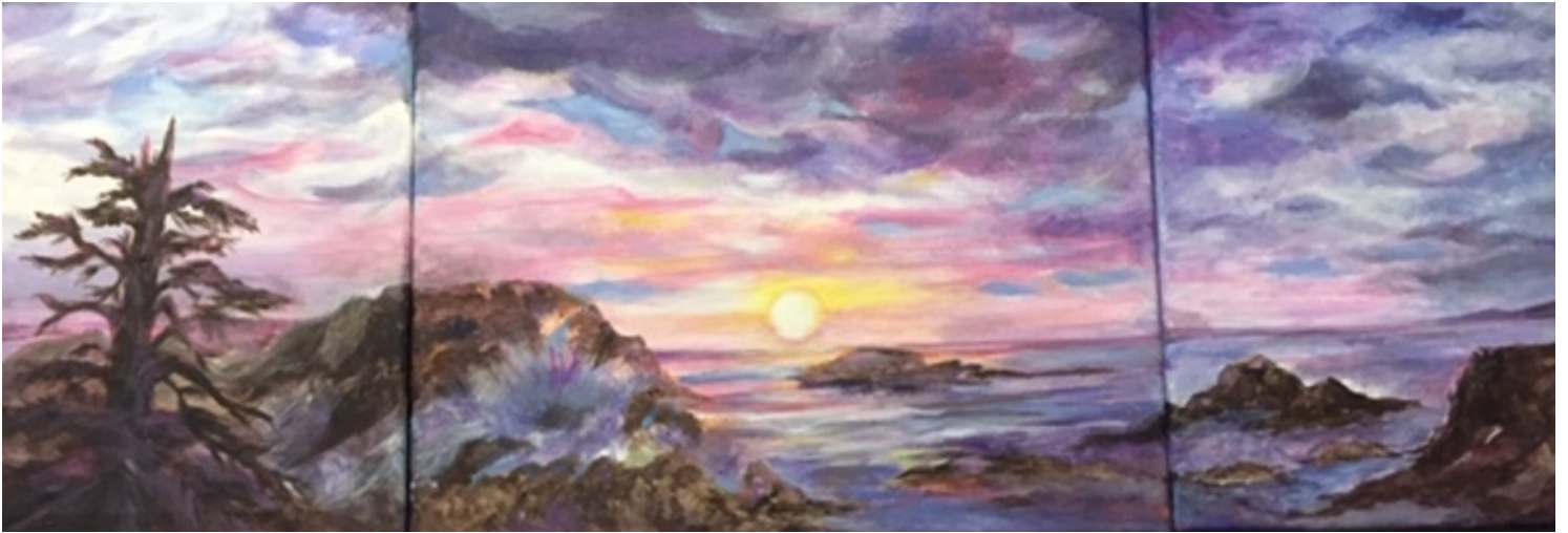
Sunrise Seascape. Taye