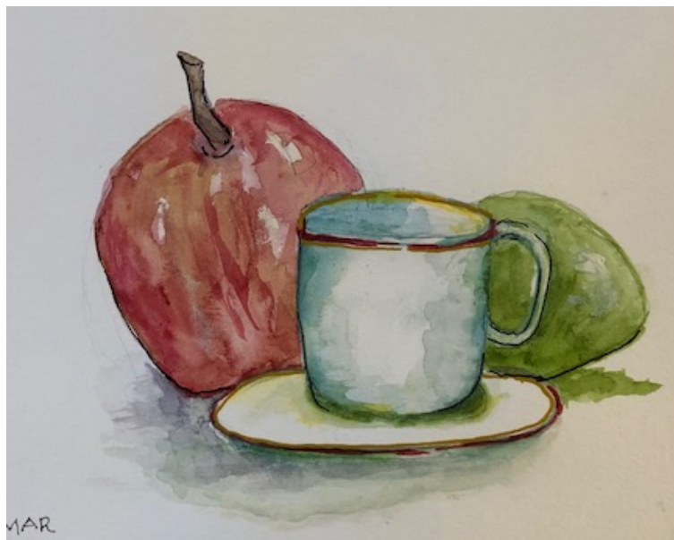
Still Life Study. Mar