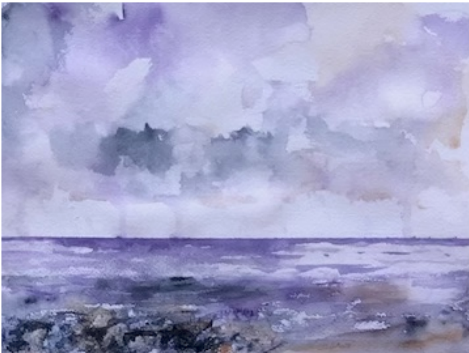
"Drippy Drips" Suzette