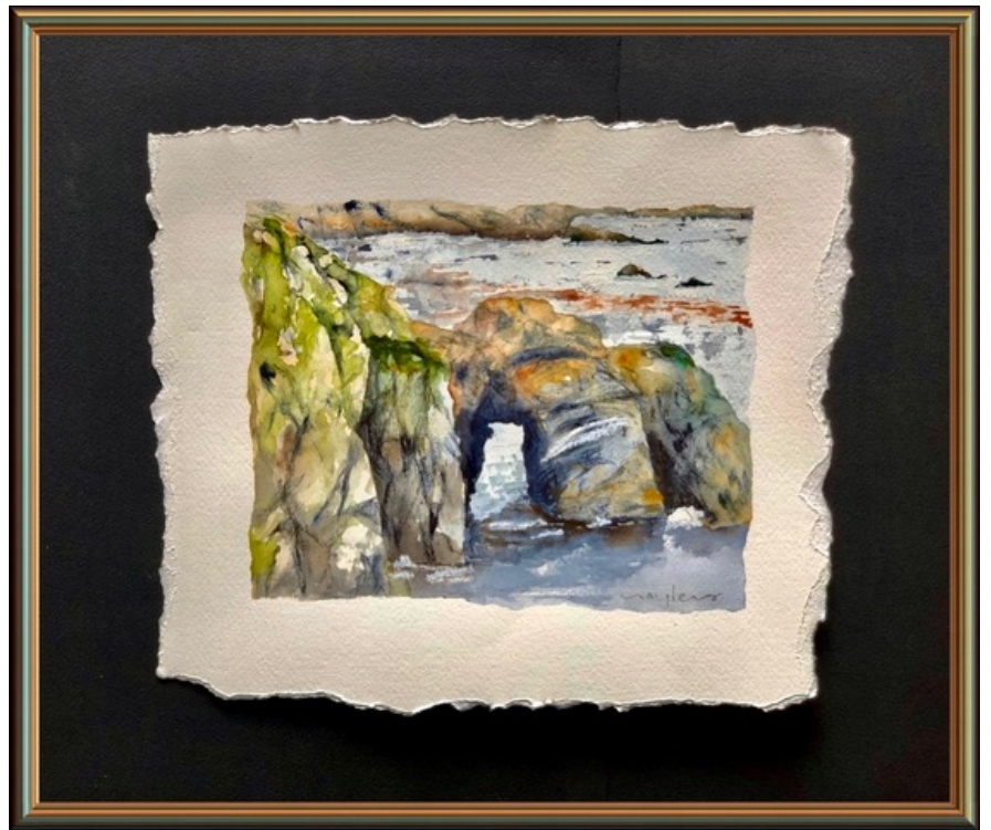
Small Point Lobos Arch. Suzette