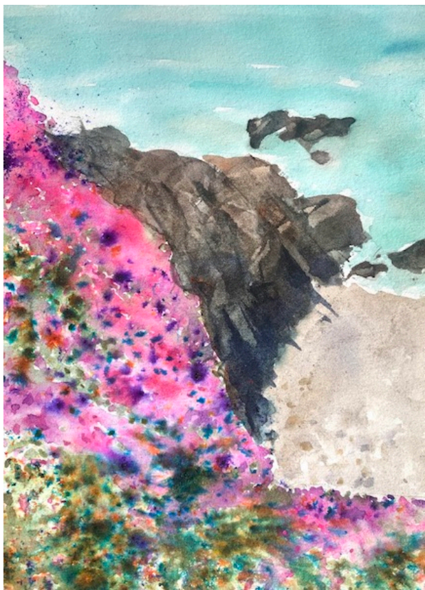
Ice Plant on the Cliff. KC