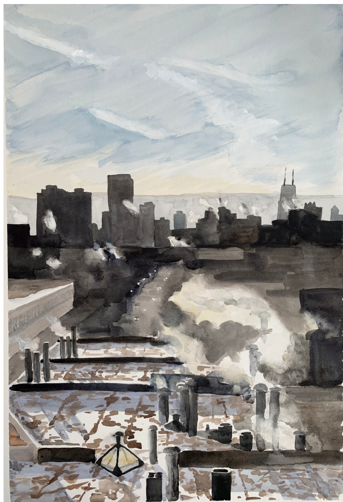
Cold Morning In Chicago. KC