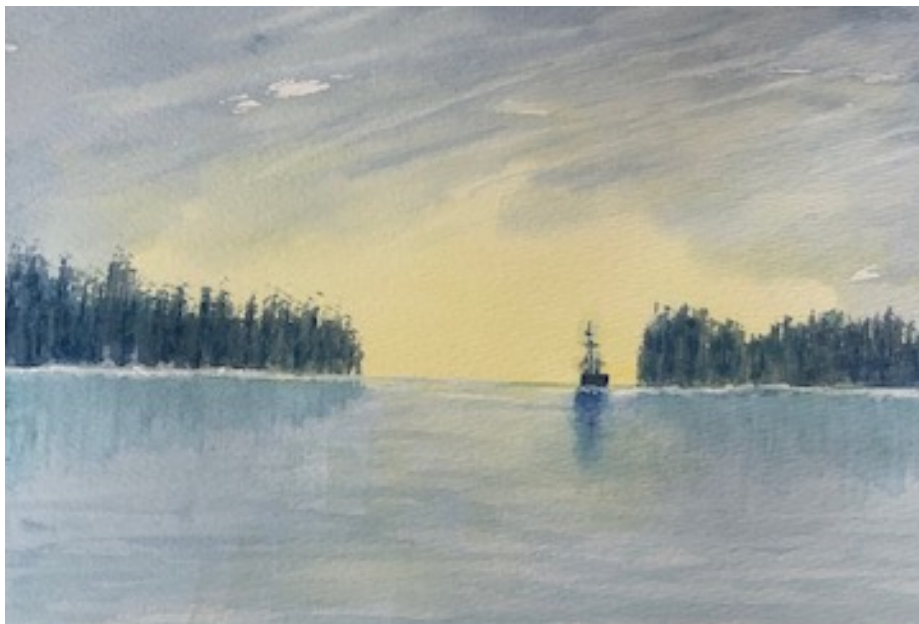
Safe Harbour. mar