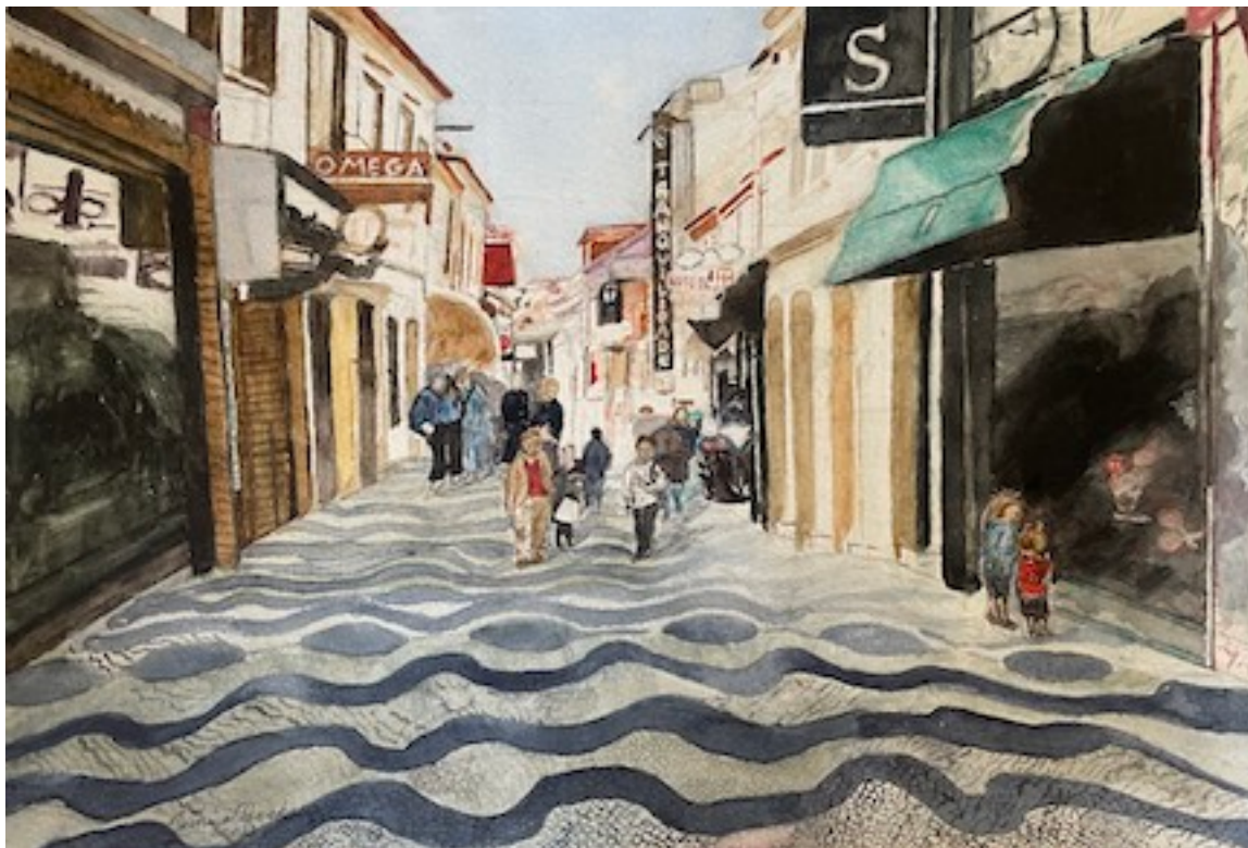
Shopping In Portugal. Tomi