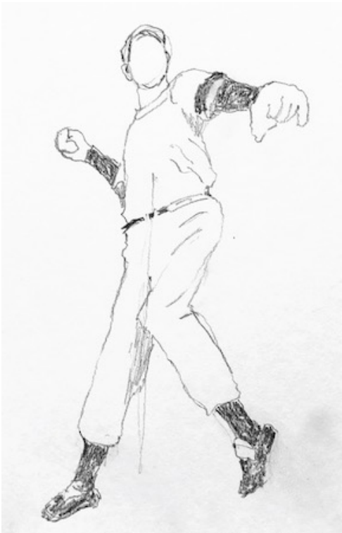
Baseball Sketches. Suzette