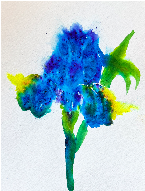
Blue Iris. KC