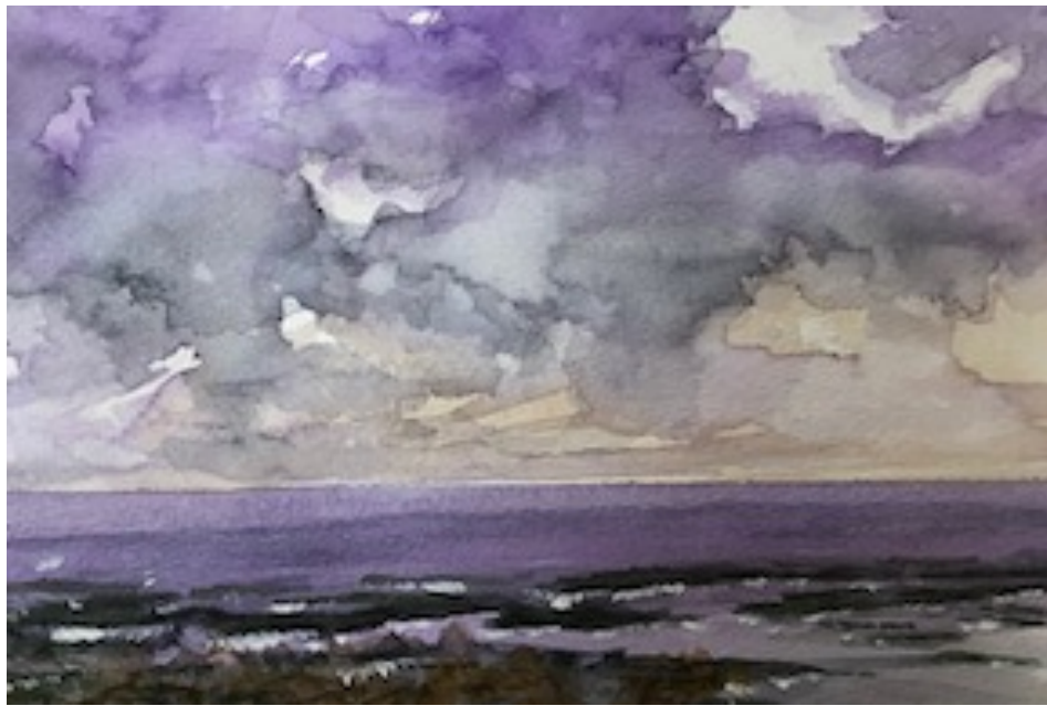
Distant Clearing. mar