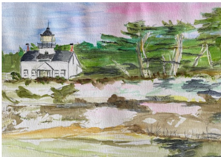
PG Lighthouse. Irene