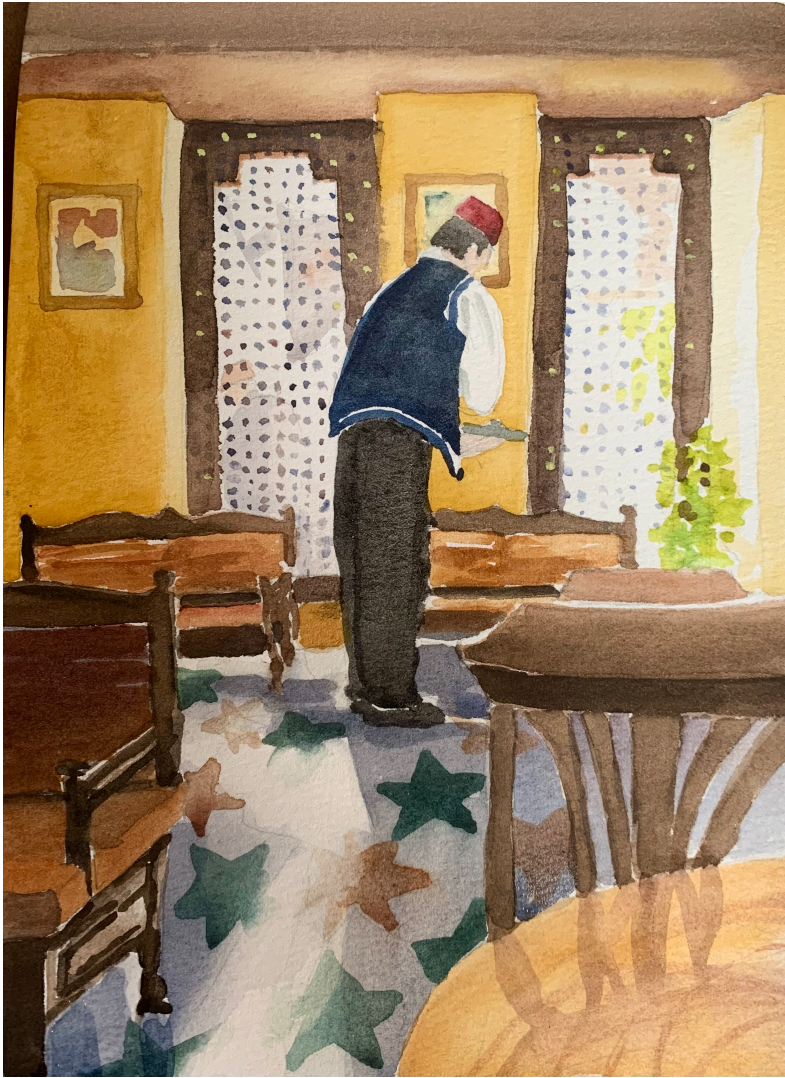
Khan El Khalili Café. KC