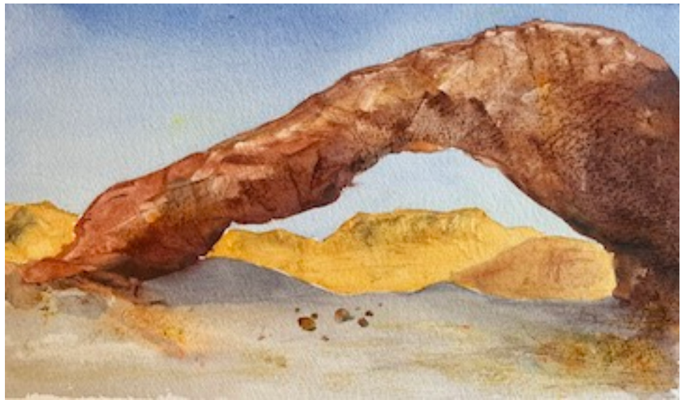
Desert Arch Rock. KC