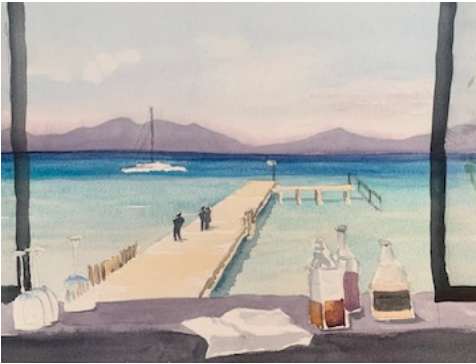
South Lake Tahoe. KC