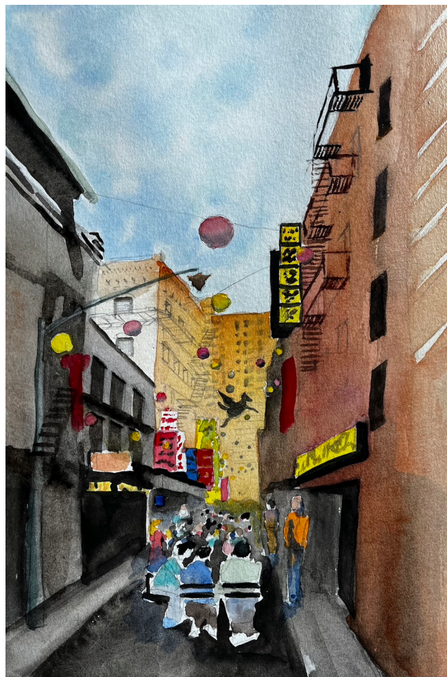
Chinatown, NYC. KC