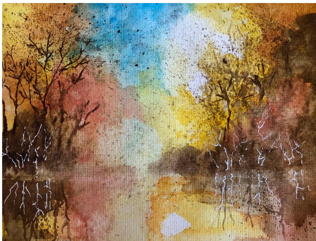
Autumn Reflections. Mar