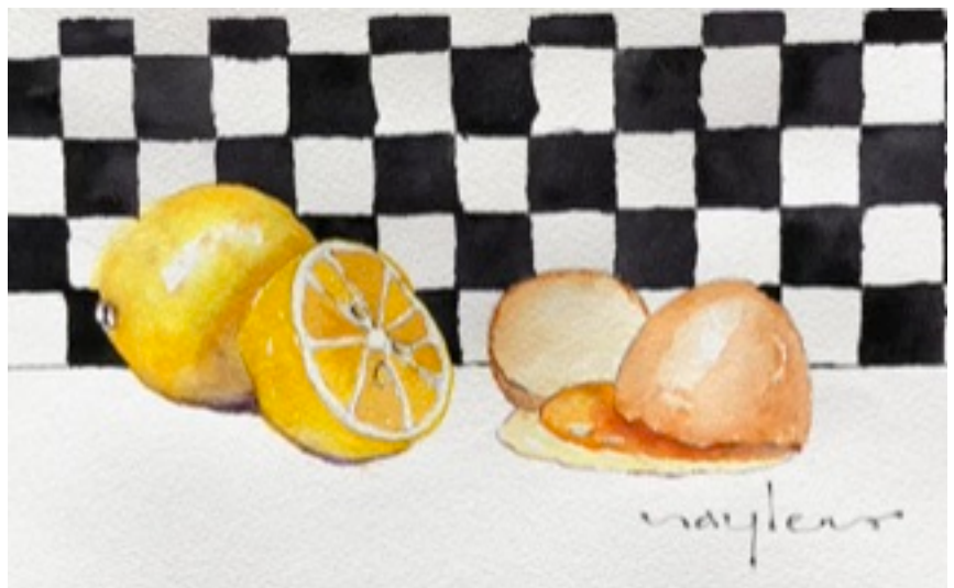
Juicy Lemon and Scrambled Eggs. Suzette