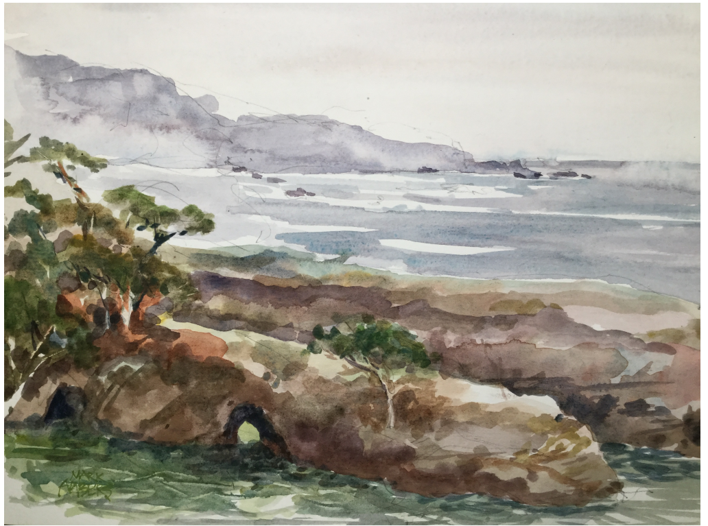
Point Lobos. China Cove View South. Mark