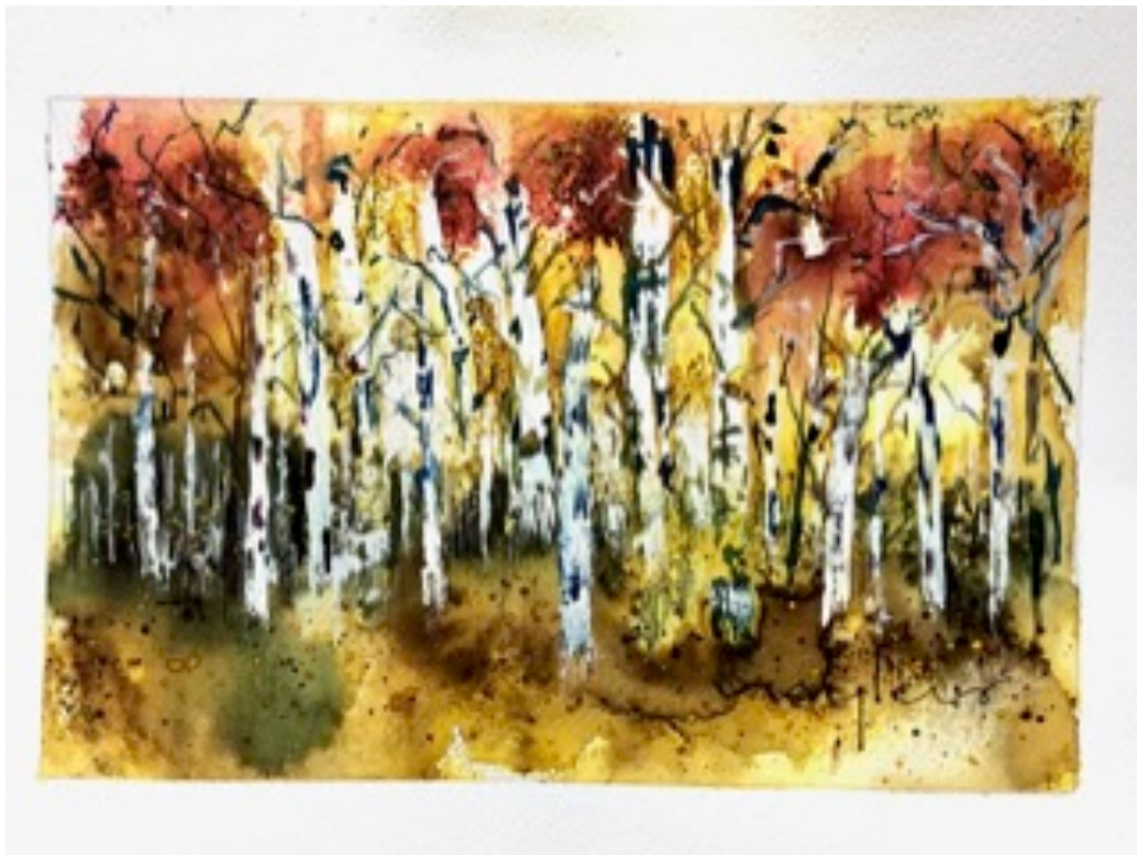
Fall Colors. Suzette