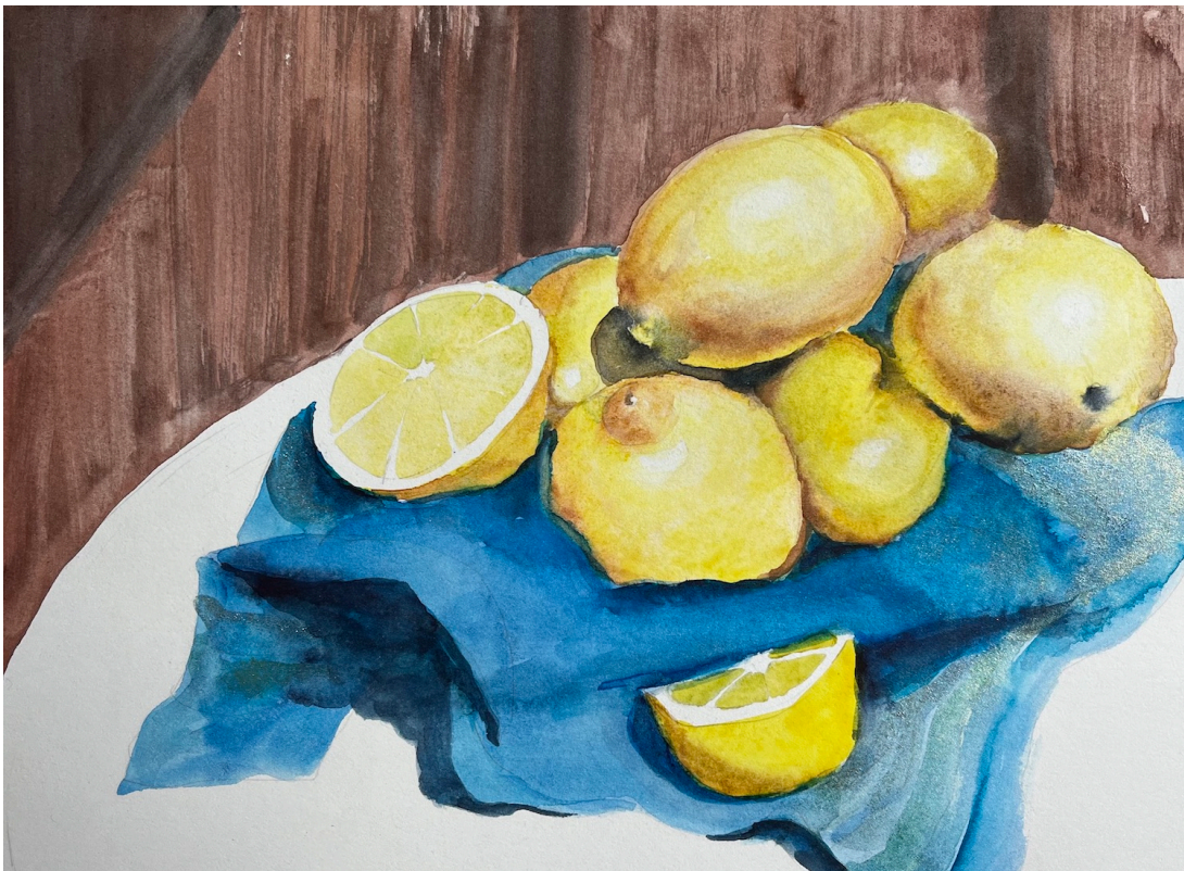
Analogous Lemons. KC