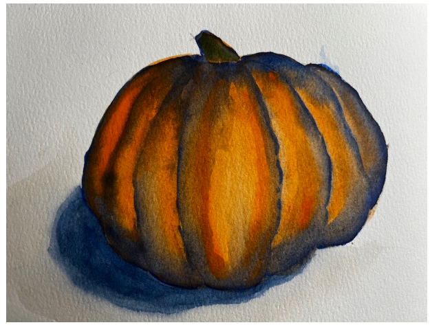
Fruity Experiments in Color. KC