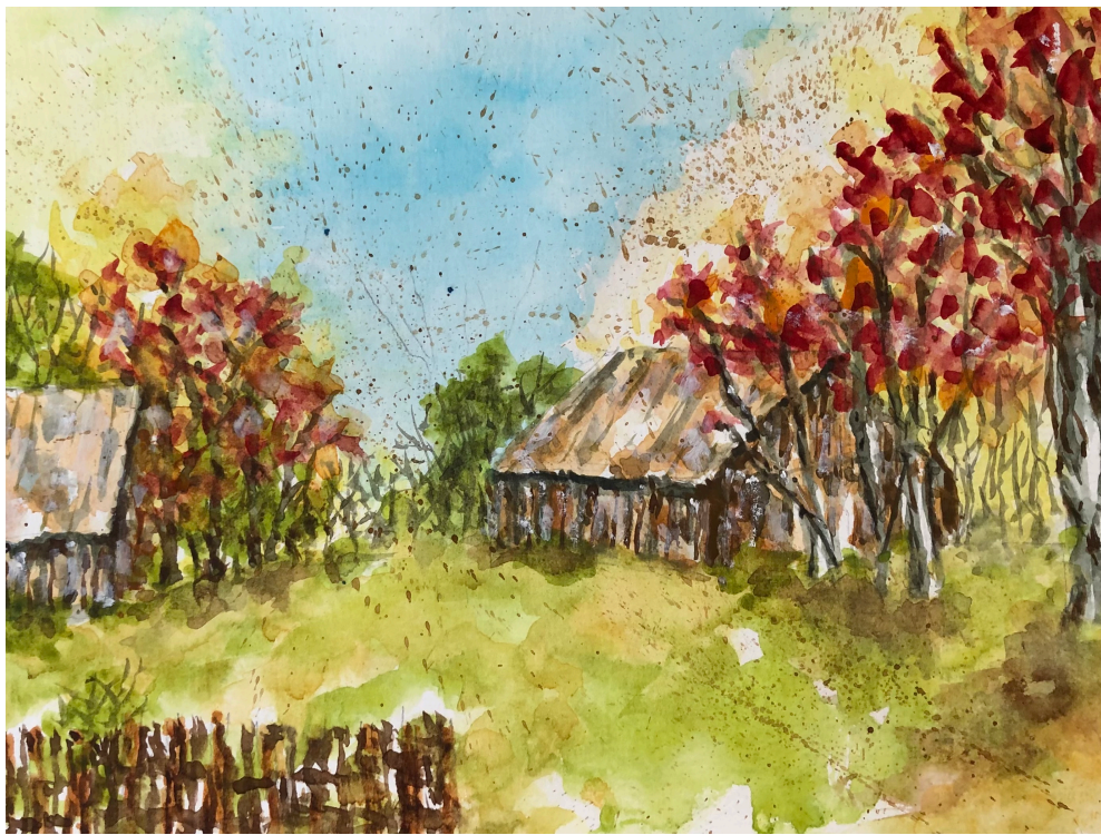
Autumn Barns. Mar