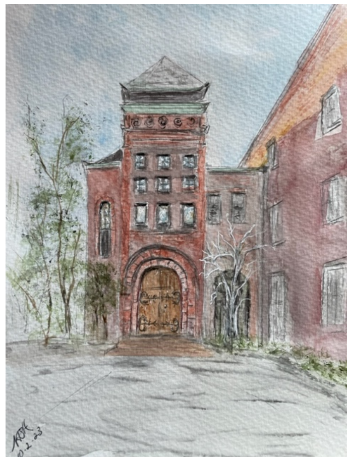
Brooklyn Building. 2023 . Nancy