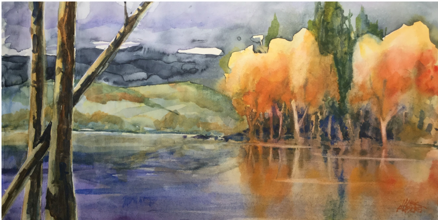
Fall Colors at Lake Shoreline.