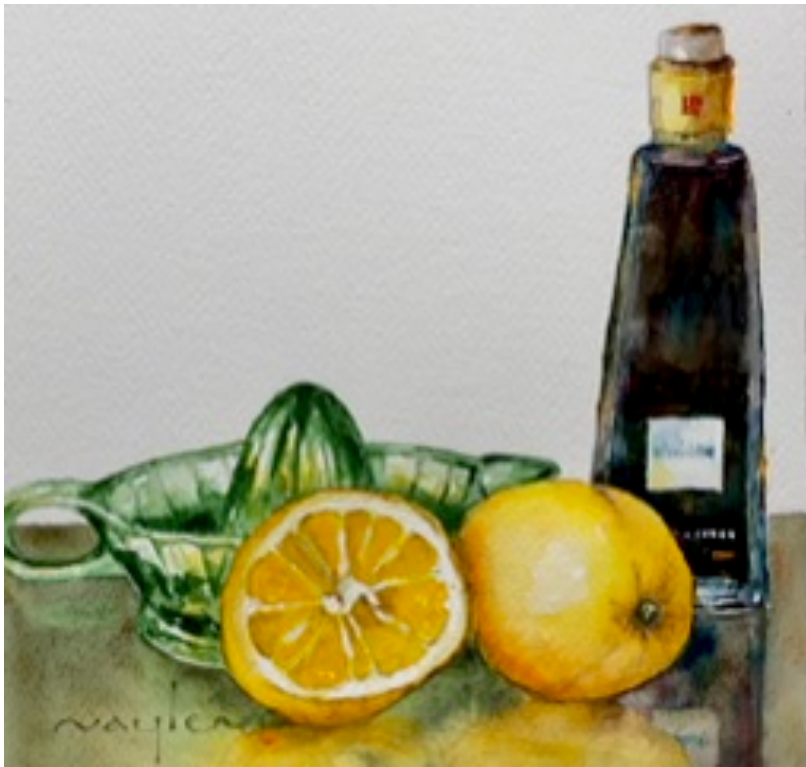
Lemon Juicer. Suzette