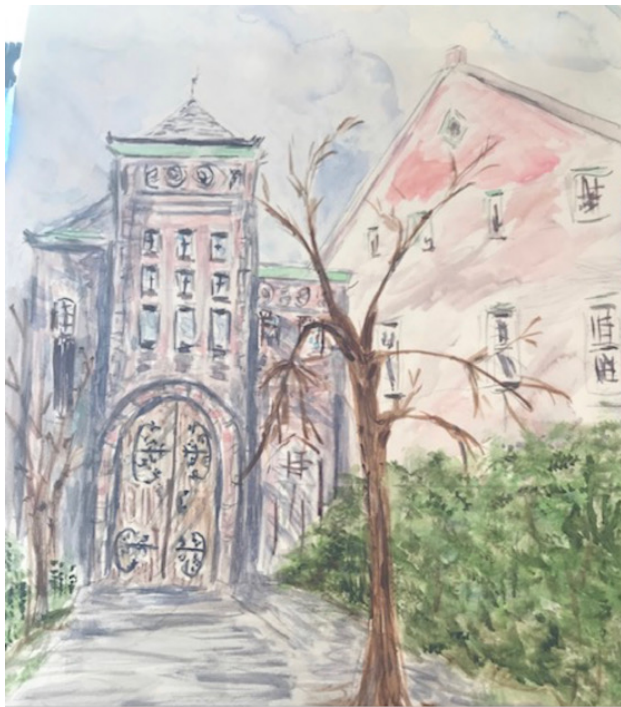
Brooklyn Building. 2019. Nancy