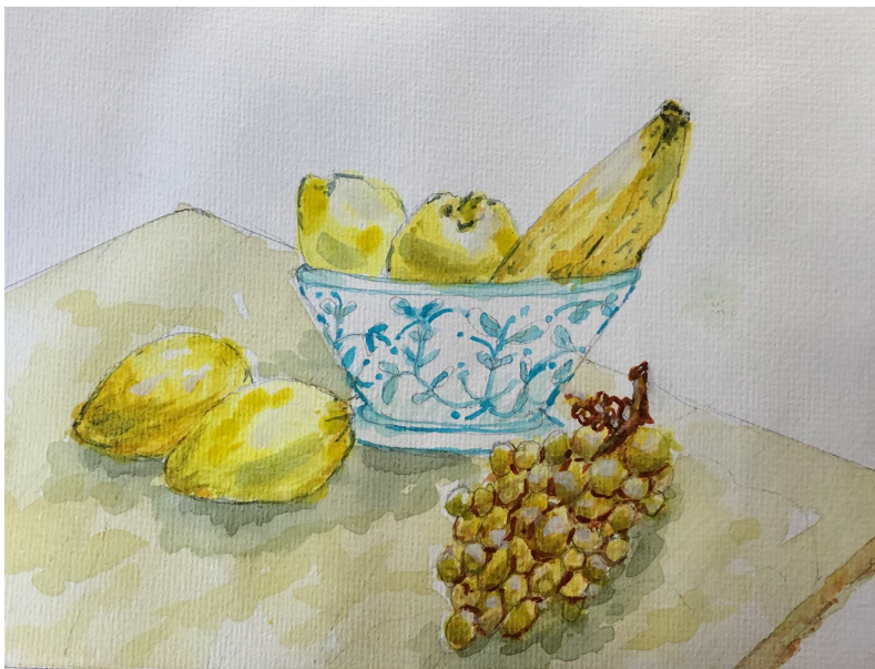
Yellow Fruit. Mar