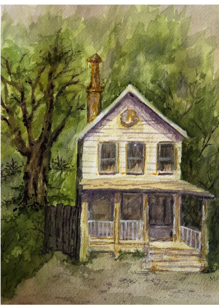
This Old House. Mar