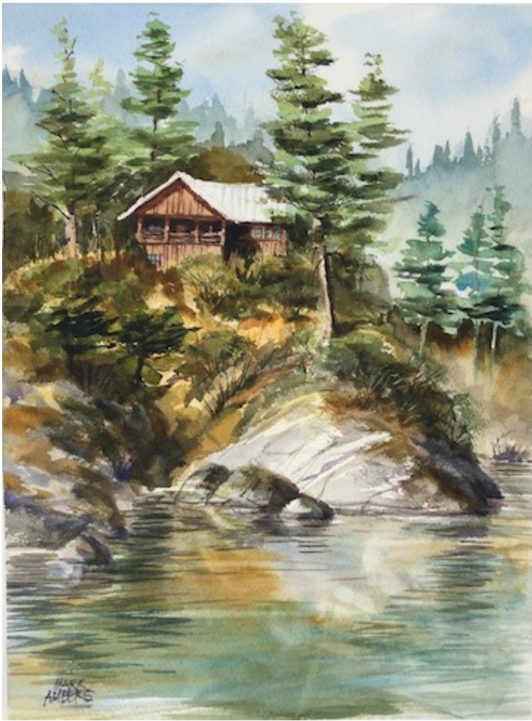
Bass Lake - Cabin Above Millers Landing Mark