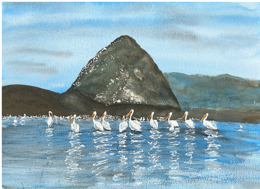
Moro Bay. Lynn