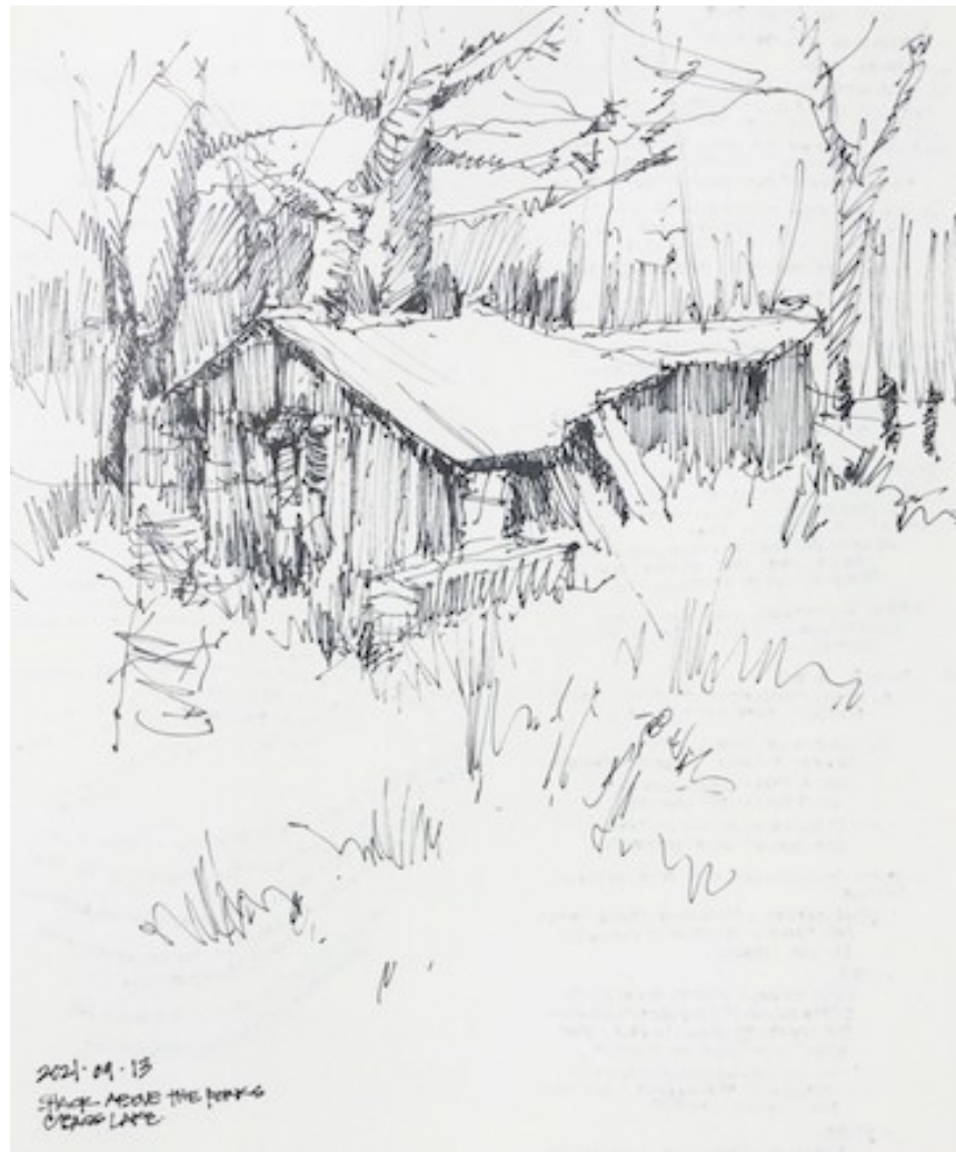
Bass Lake - Listing Shack Above The Forks Mark