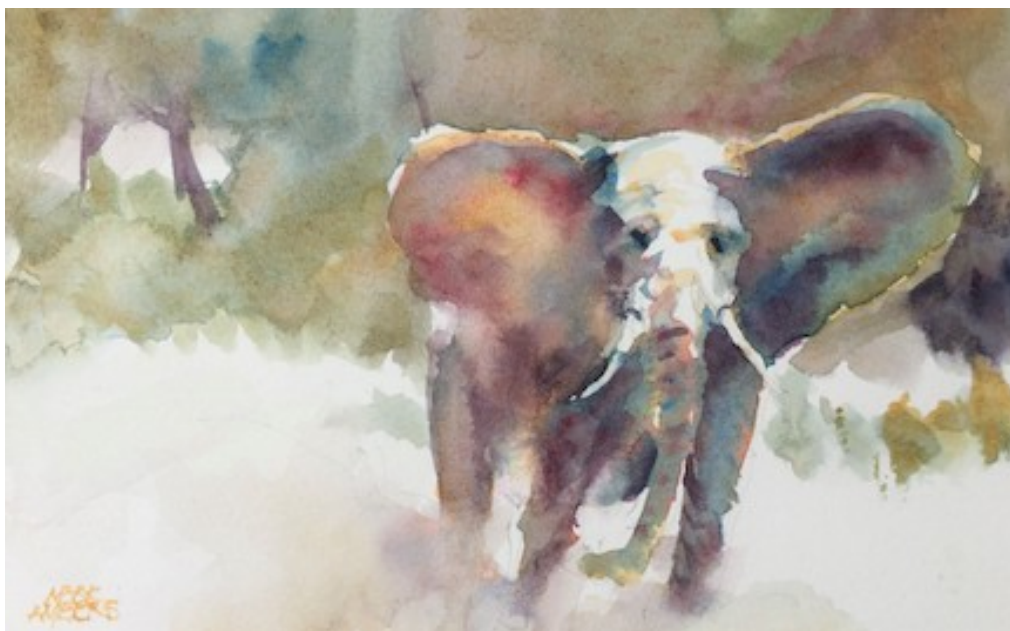
Elephant on Velt.