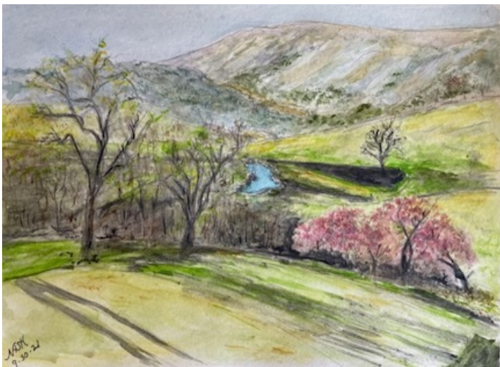
Spring Landscape. Nancy