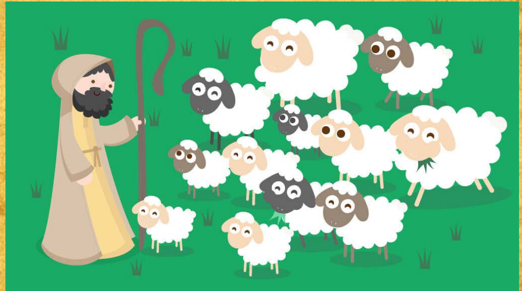
Pastor & Teacher