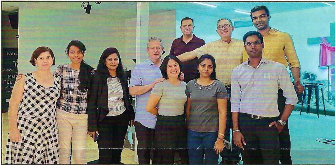
LEADERS AT ENGLISH FELLOWSHIP OF GUADALAJARA

A while back I felt that our Indian members needed to feel more included at church so I invited several of them to help in leading our Sunday services: giving the initial welcome and announcements, saying certain prayers, and reading a benediction. This seems to have helped them know that they are valued and accepted. We enjoy their enthusiasm and sense of humor.