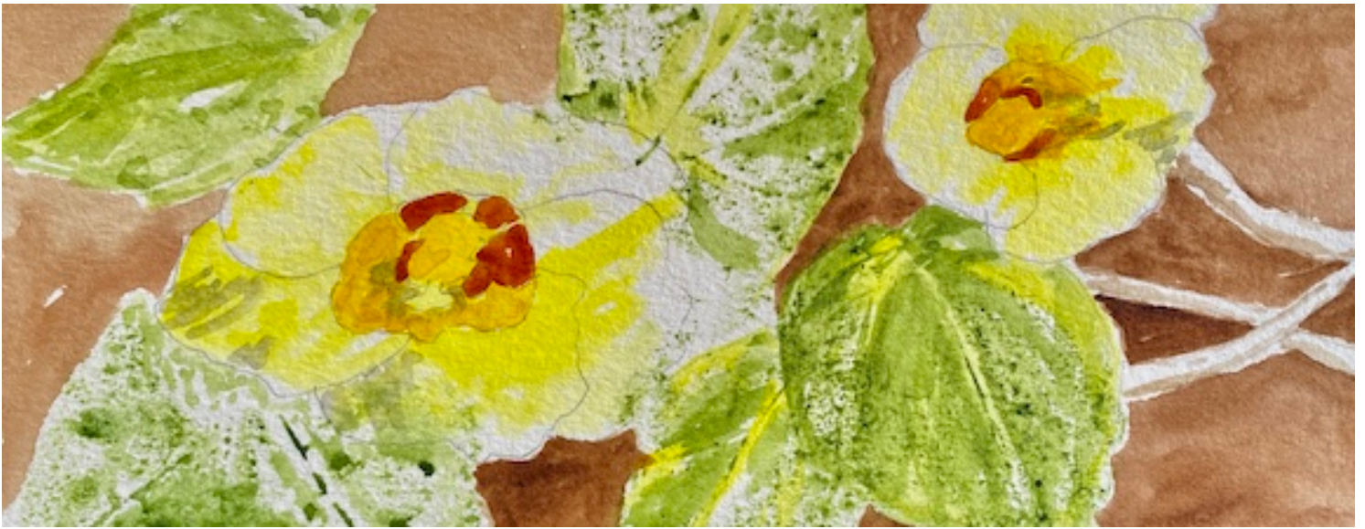
Woodcut of Maho Flower with Natural Leaf Print. Irene