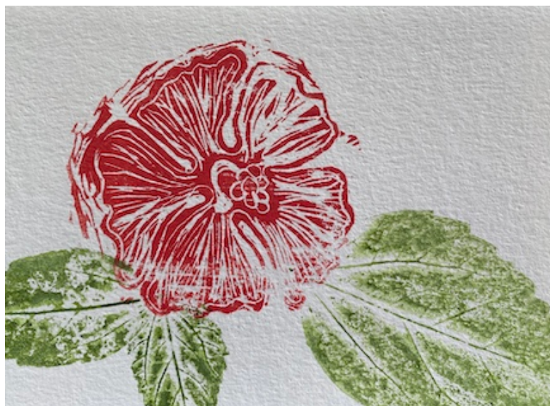
Carved Woodcut of Hibiscus Flower. Irene