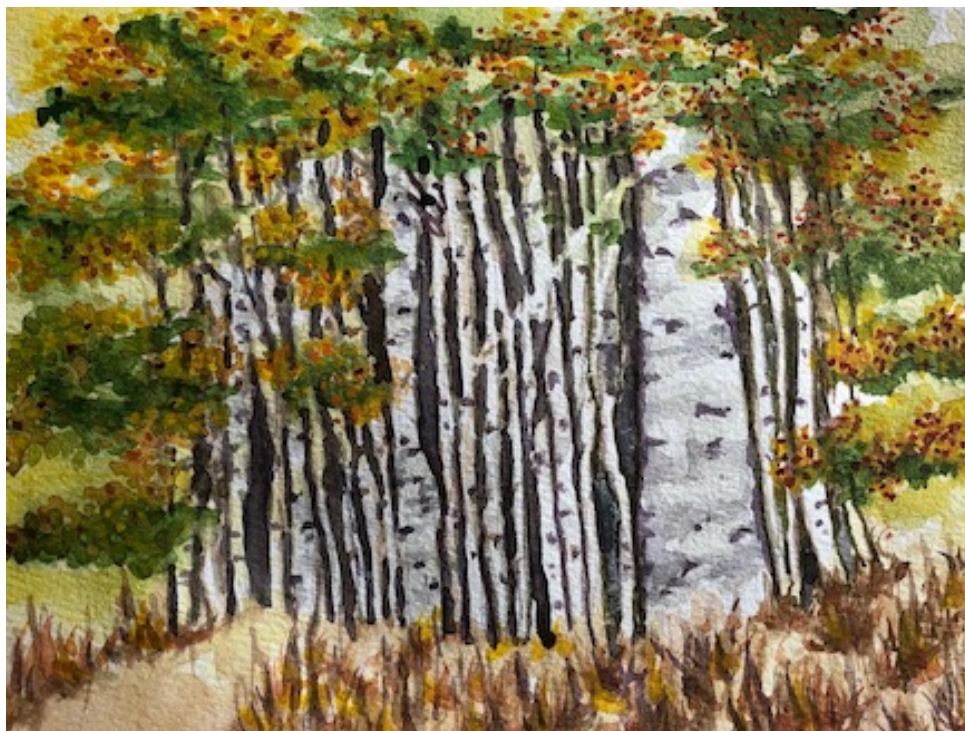
Birch Grove. Mar