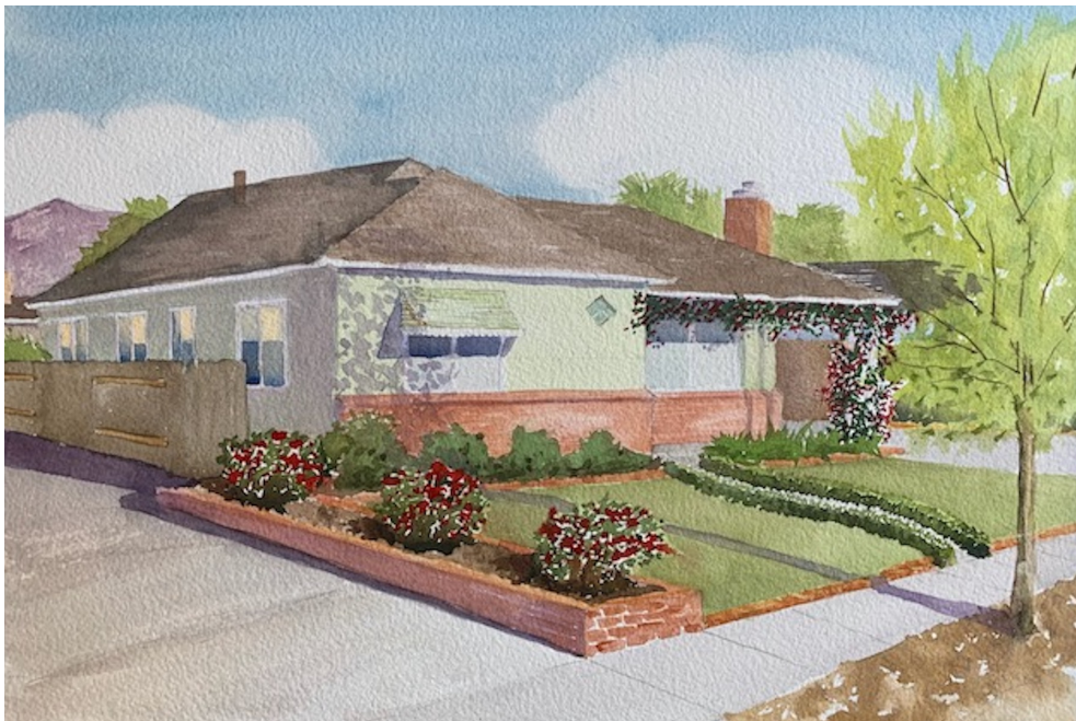
Fred's House. KC