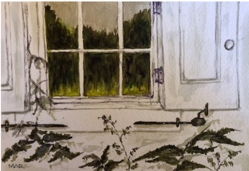
Andrew Wyeth Study. Mar