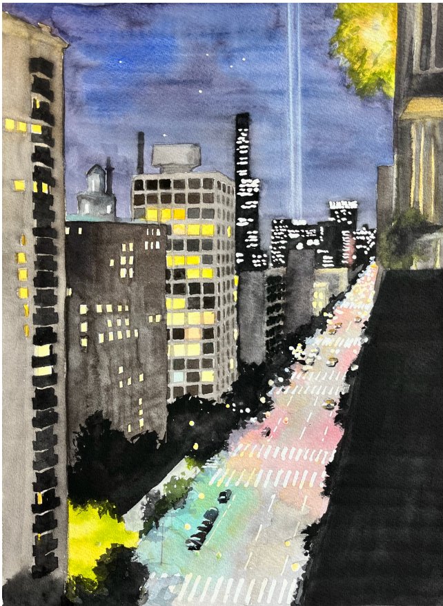
94 th Street View on 9/11/22