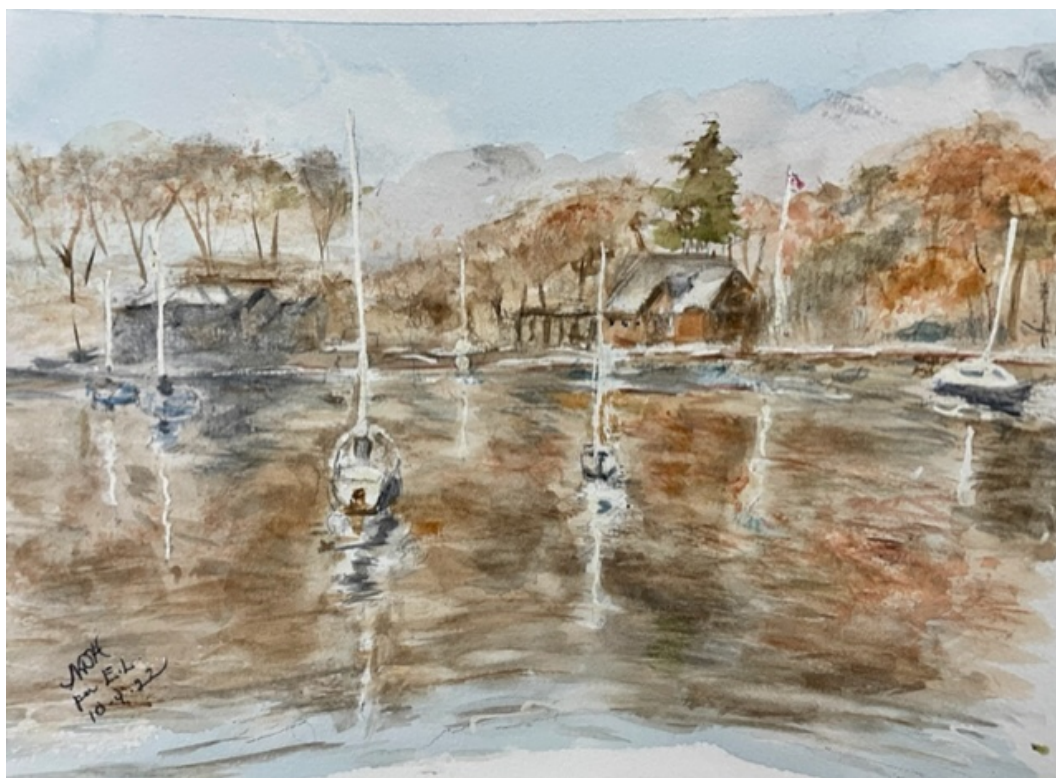
Harbor Scene. Nancy