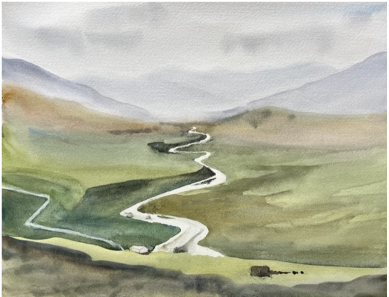
River Valley. KC