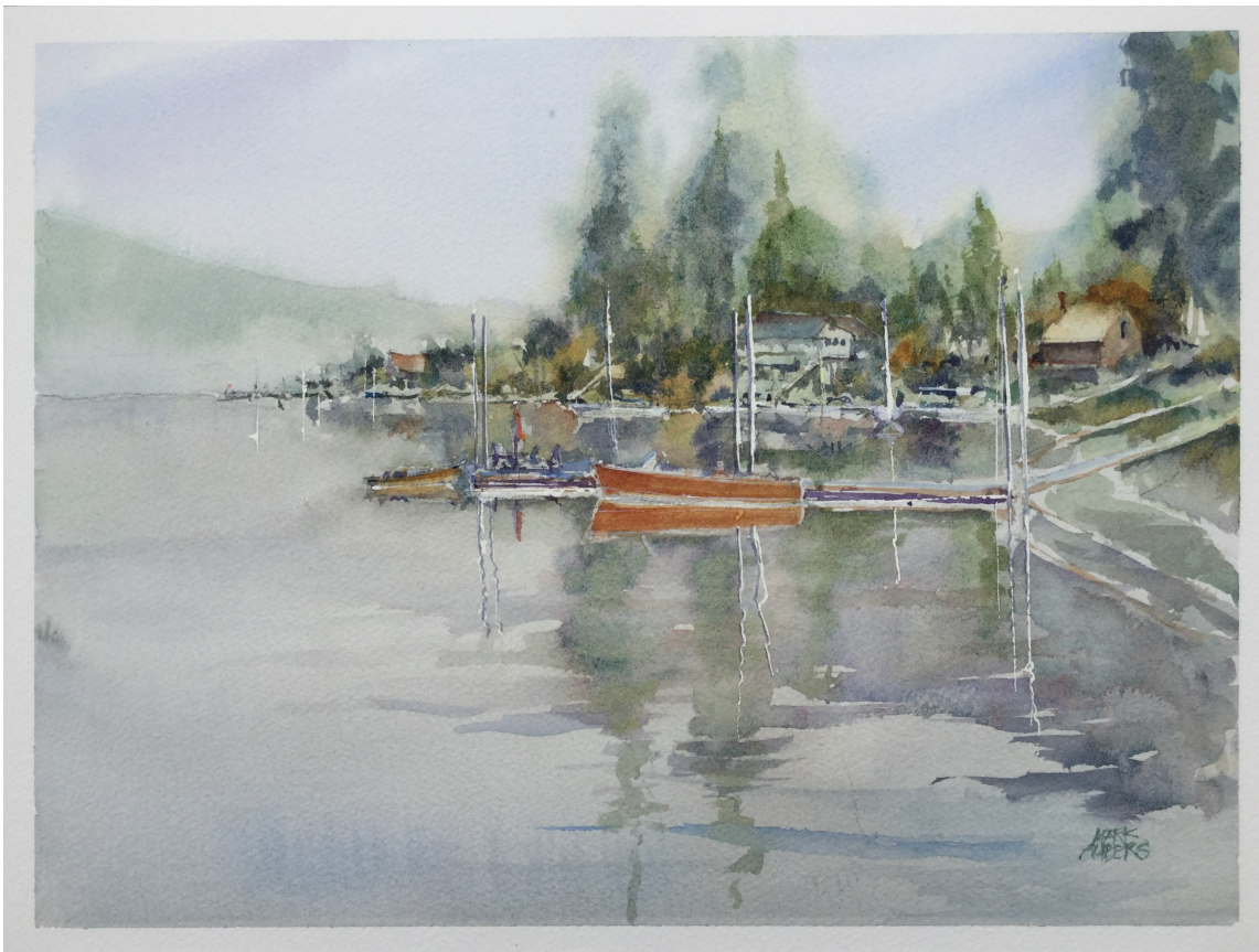
Bass Lake Misty Morning.