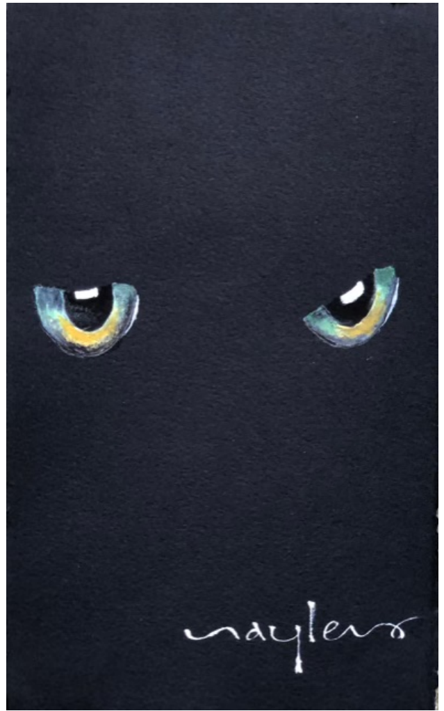
Black Cat On A Dark Night. Suzette