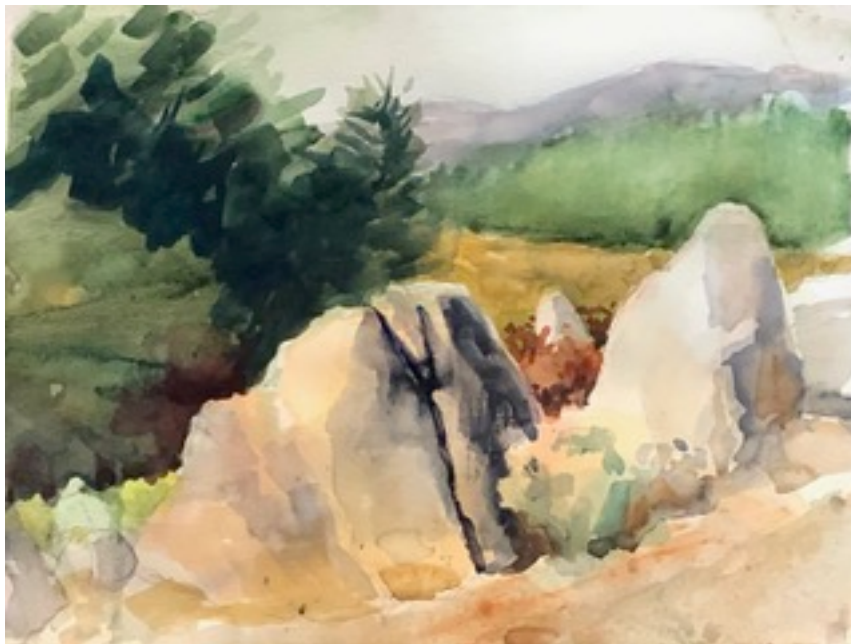
Tahoe Trail. Tim