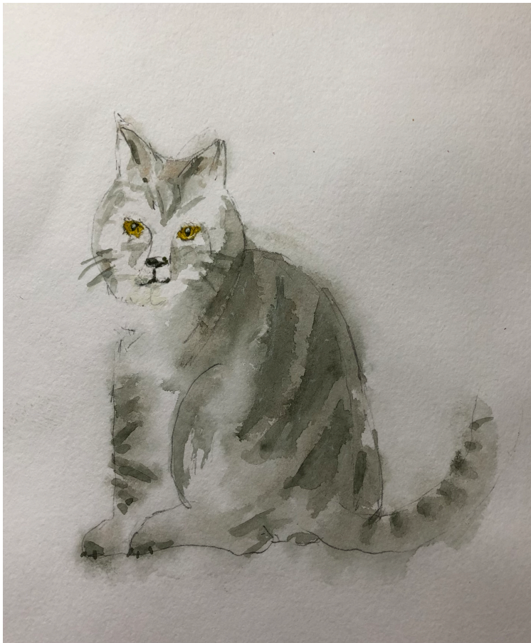
Our Neighborhood Bobcat. Mar