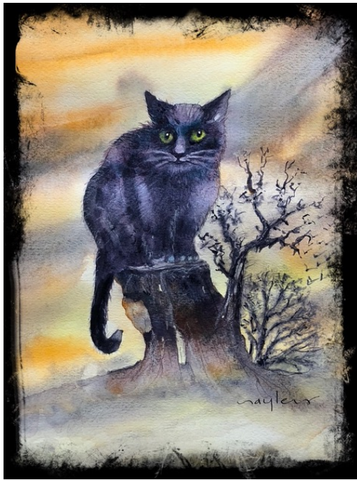
Spooky Black Cat. Suzette