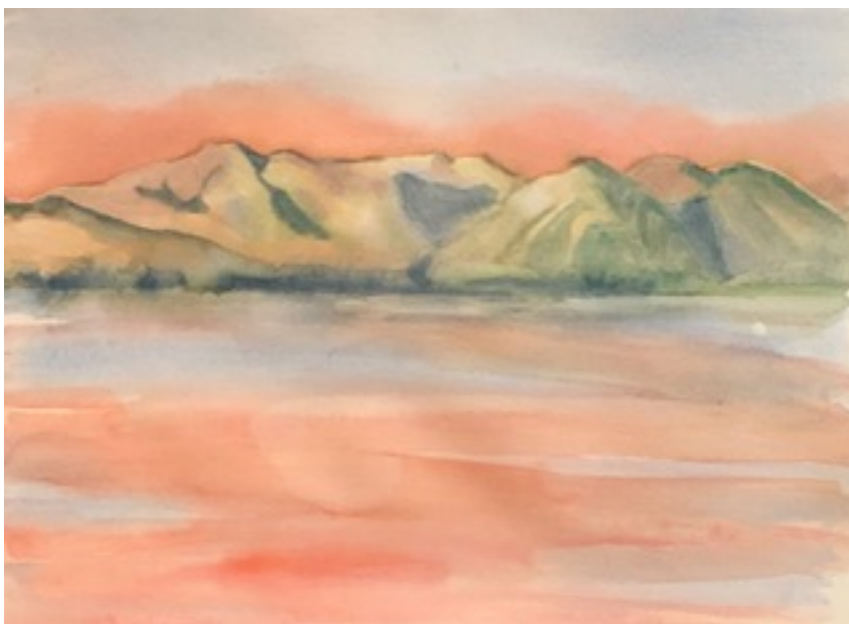
Morning Color. Rose