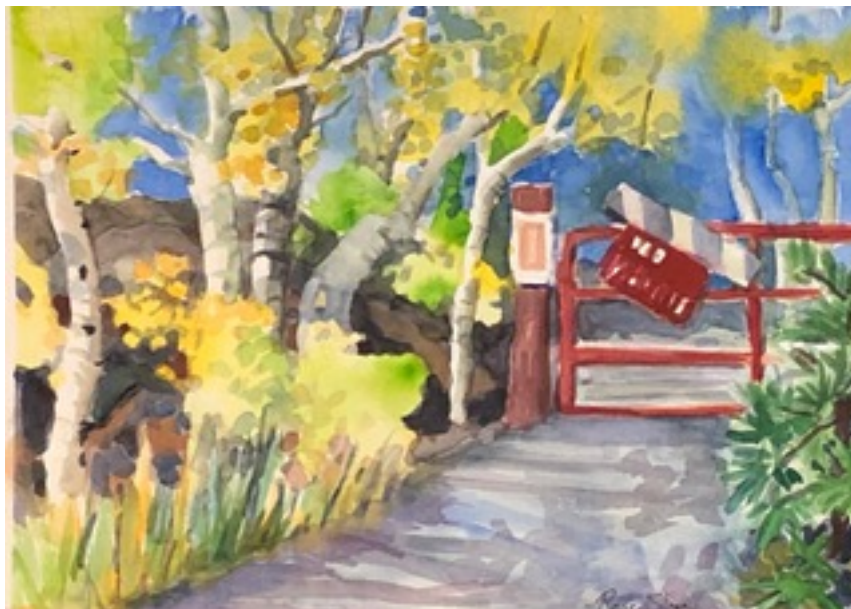
Open The Gate Rose