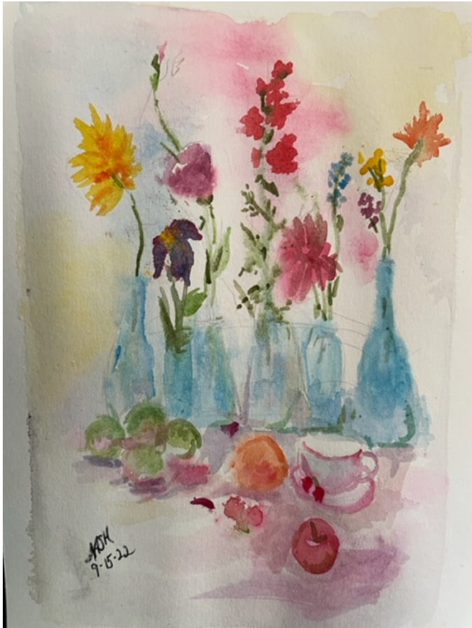
Playful Flowers. Nancy