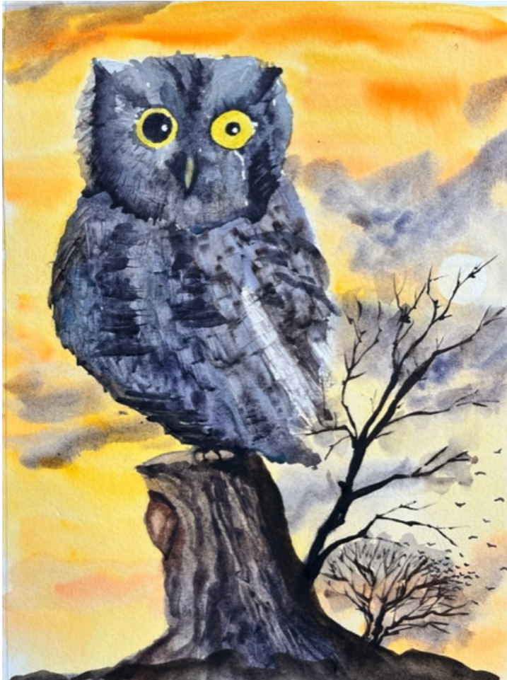
Spooky Owl. KC