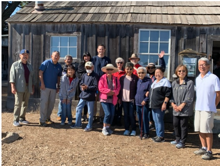
Whaler's Cabin, Point Lobos.