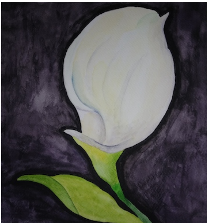
Calla Lily with Black Background. Regina