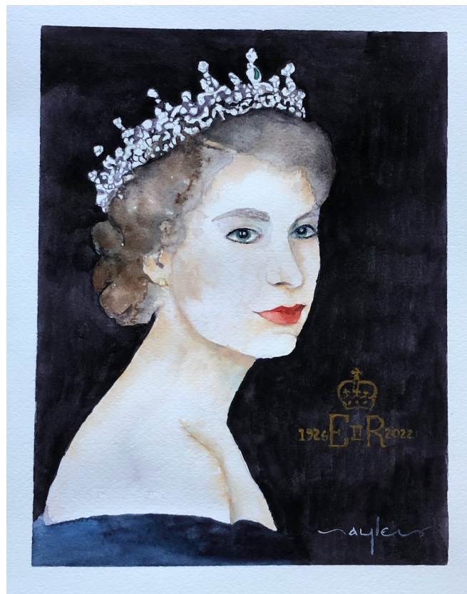
Remembering The Queen