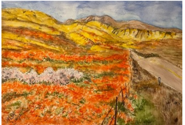
Corrizo Plain Super Bloom. Nancy